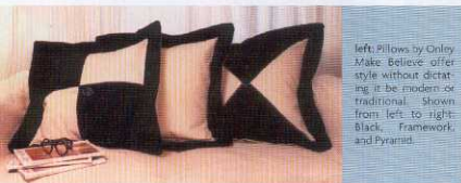
Left: Pillows by Onley Make Believe offer style without dictating if be modern or traditional. Shown from left to right: black, framework, and Pyramid.