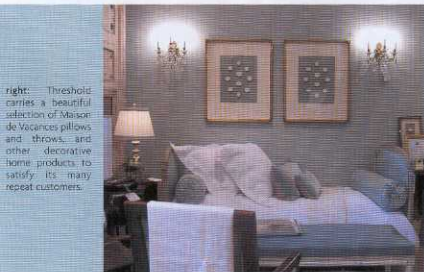
right: Threshold carries a beautiful selection of Maison de Vacances pillows and throws, and other decorative home products to satisfy its many repeat customers.